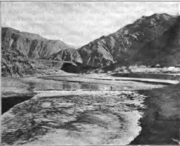
LORA RIVER AT ITS JUNCTION WITH THE SHIRTO RIVER.

Both these river systems differ widely in character one from the