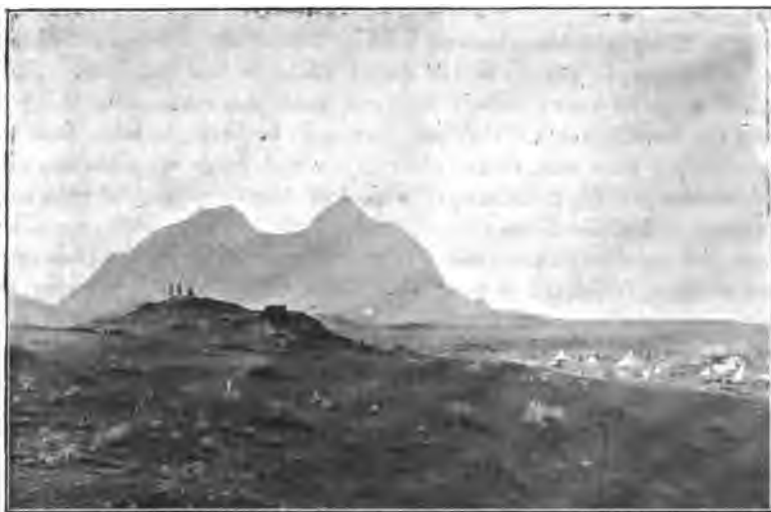
ROBAT, WITH THE MABITE DOKH AND MOUNT.

The heat had by this time become very severe. The thermometer used to record up to 116^{\circ} Fahr. inside our tents, and our solar radiation thermometer used to register outside on cloudless days a sun-heat of 205^{\circ} Fahr. by nine o'clock in the morning. It was not made to register higher than that, or we might have obtained still higher records. As it was, it used to register in places a temperature in the sun equal to that of boiling water at the same place. At any rate, we found it quite hot enough for ordinary comfort, and the heat, combined with a strong hot wind and sand-storm, often made rest during the daytime impossible.