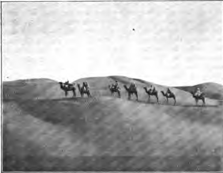
MARCHING IN SANDHILLS.

Somehow one generally connects the word "desert" with a flat level country, but it is obviously wrong to suppose that a desert consists of only plains. From Nushki to Chagai we do find a vast level plain, and a plain, moreover, of alluvial soil. You will see that all the drainage from the mountainous country to the east of it, as far as Quetta and Peshin, flows out into this plain by the Lora and other rivers, and that these rivers find their terminus in the Lora Hamun. In flood-time this Hamun is a wide sheet of shallow water, but it soon evaporates, and for most part of the year is like it was when we saw it, a large sheet of dry salt. In old days this whole plain, including all the flat Shorawak plain, must have been a huge lake, to account for all this