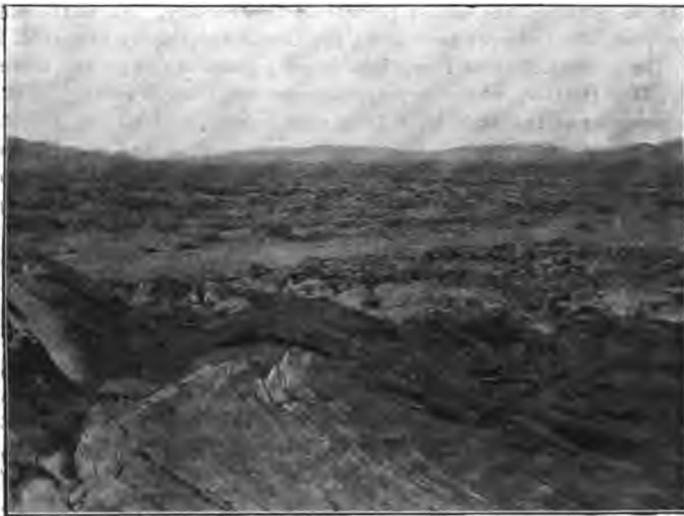
KHORASSAN PLAINS, LOOKING TOWARDS DOCHINA AND KATAWAZ.

Domandi deserves a few words of mention. Here the Gomal and Kunder rivers meet and form one stream under the name of the Gomal,