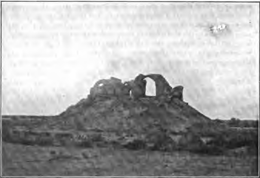
RUIN AT GODAR-I-SHAH.

Beyond Robat the desert becomes practically almost a waterless one, and we found that it would be suicidal to attempt to take on our large camps with such feeble camels beyond that place. The British main camp remained at Robat, where there was a good supply of spring water; and the Afghan main camp withdrew to the Helmand river,