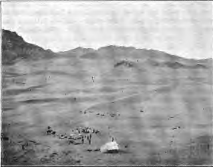
SAND DESERT NEAR AMIR SHOH.

at a point considerably south of the Khojak, this earthquake crack would have cut through it near the centre, thus enabling many valuable but possibly expensive observations to be made. This crack seems to mark the line of a gigantic geological fault. All the rocks on the east appear to be sedimentary, while those on the west appear to be igneous. In fact, as far as the Persian border on the west of it, we found nothing but igneous rocks. I am told the length of this fault-line exceeds that of any fault-line as yet discovered on this Earth. Whatever it may be, this earthquake crack or fault-line, whichever you prefer to call it, is a very