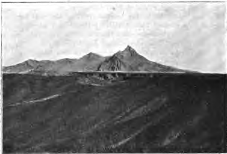
ZARMELAN PLAIN AT DOMANDI.

the women folk of the wealthier men; and you see women staggering along, one with a child on her back, another with a lame sheep under her arm; children carrying smaller children or kids or lambs. Then come the donkeys and bullocks, some with loads, others with children and babies roped face upwards on their backs. One by one, as they reach the camping-ground, the women and children unpack their belongings and set up their tents; the latter is not a difficult process, as it only consists of setting up four sticks and draping coarse black goathair blankets on the top and round the sides. Then the boys and a guard of well-armed men drive off the camels and flocks to graze on the adjacent mountain-